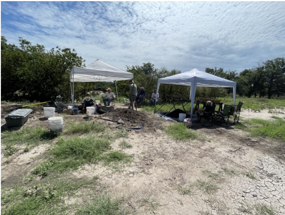
Gilger site looking toward the San Saba River.