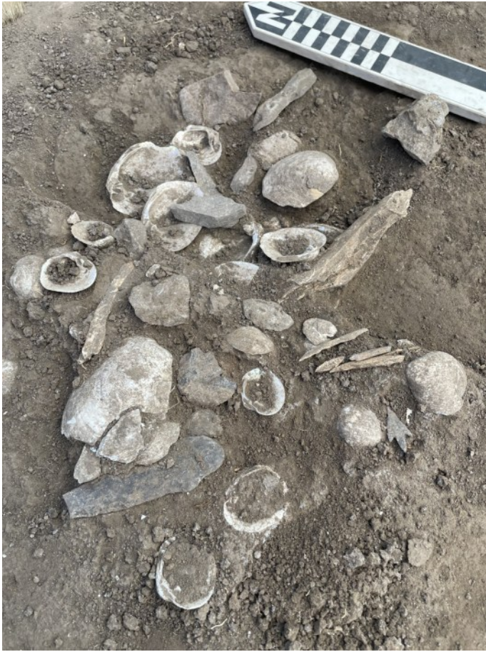
Basin feature full of mussel shell, bison bones, and artifacts including (visible in photo) a beveled biface, on left and Perdiz arrow point on right.