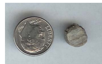
Lead ball from 41BL116.